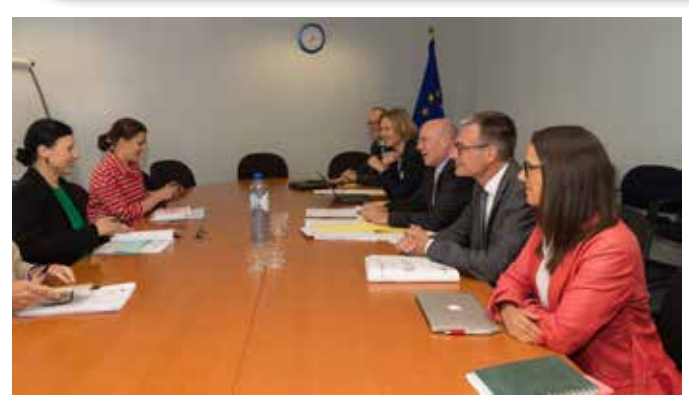
Meeting with ECBA, CCBE and EU Commissioner Věra Jourová

On 20 September , representatives from the CCBE, together with representatives from the ECBA, had an excellent exchange of views with EU Commissioner Věra Jourová, Commissioner for Justice, Consumers and Gender Equality.